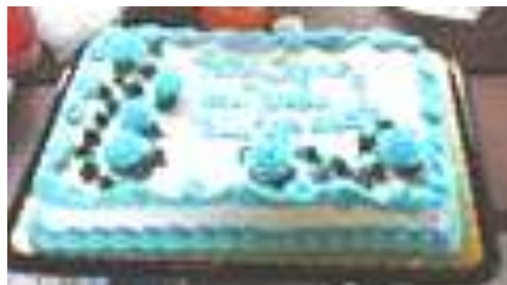
Patty's farewell cake